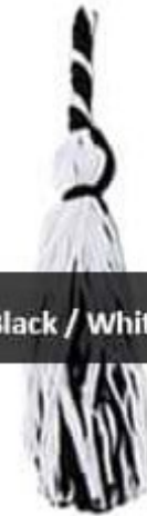
Black / White